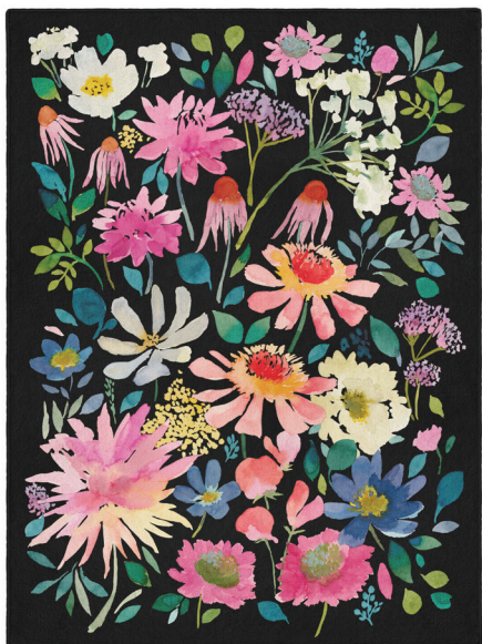
Zinnia 016505 140x200cm | 170x230cm 200x280cm | 250x350cm Digitally Printed 100% Polyamide