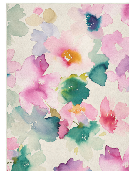
Sanna 015902 140x200cm | 170x230cm 200x280cm | 250x350cm Digitally Printed 100% Polyamide