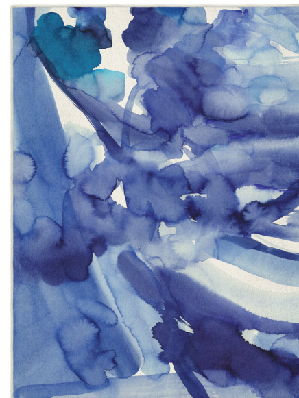
Blue Skies 013708 140x200cm | 170x230cm 200x280cm | 250x350cm Digitally Printed 100% Polyamide