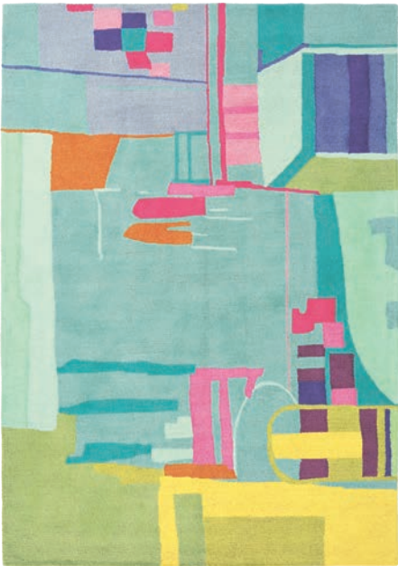
Amal 19707 140 x 200cm | 170 x 240cm | 200 x 280cm Handtufted loop pile 100% wool