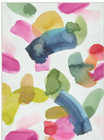
Pedro 015402 140x200cm | 170x230cm 200x280cm | 250x350cm Digitally Printed 100% Polyamide