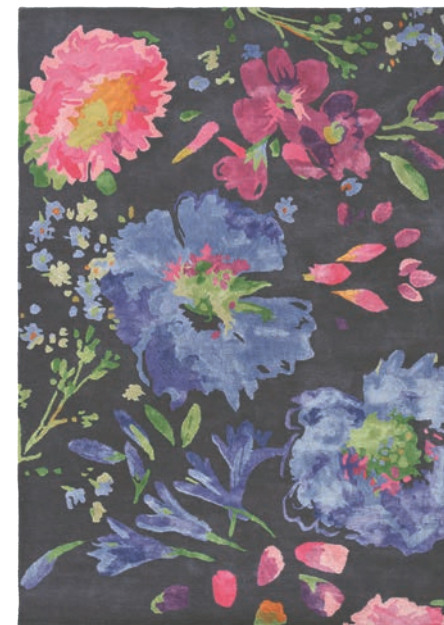
Kippen 18705 140 x 200cm | 170 x 240cm | 200 x 280cm Handtufted cut pile wool | viscose