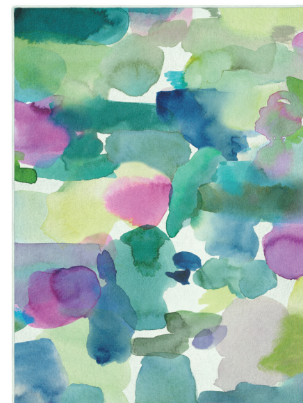
Rothesay 015707 140x200cm | 170x230cm 200x280cm | 250x350cm Digitally Printed 100% Polyamide