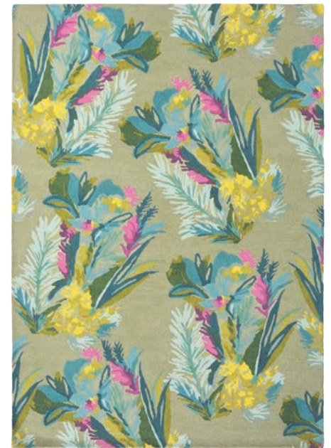
Jungle 18307 140 x 200cm | 170 x 240cm | 200 x 280cm Handtufted loop pile 100% wool