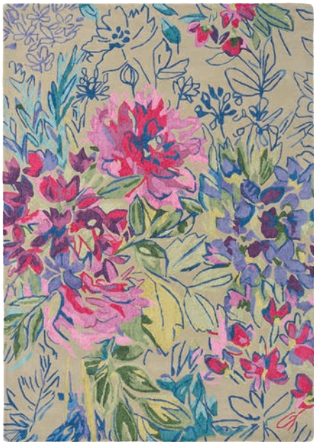
Ines Jardin 19904 140 x 200cm | 170 x 240cm | 200 x 280cm Handtufted cut | loop pile wool | viscose