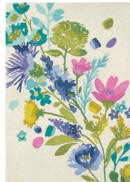
Tetbury Meadow 19201 140 x 200cm | 170 x 240cm | 200 x 280cm Handtufted cut pile 100% wool