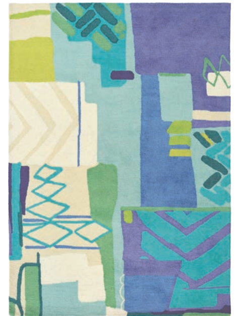
Atlas 19808 140 x 200cm | 170 x 240cm | 200 x 280cm Handtufted loop pile 100% wool