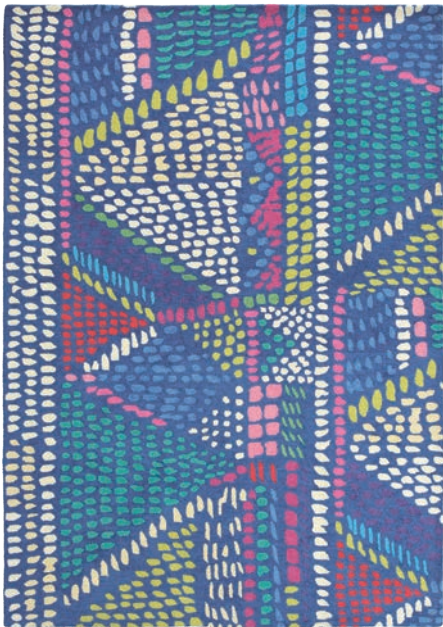
Palais 18408 140 x 200cm | 170 x 240cm | 200 x 280cm Handtufted loop pile 100% wool